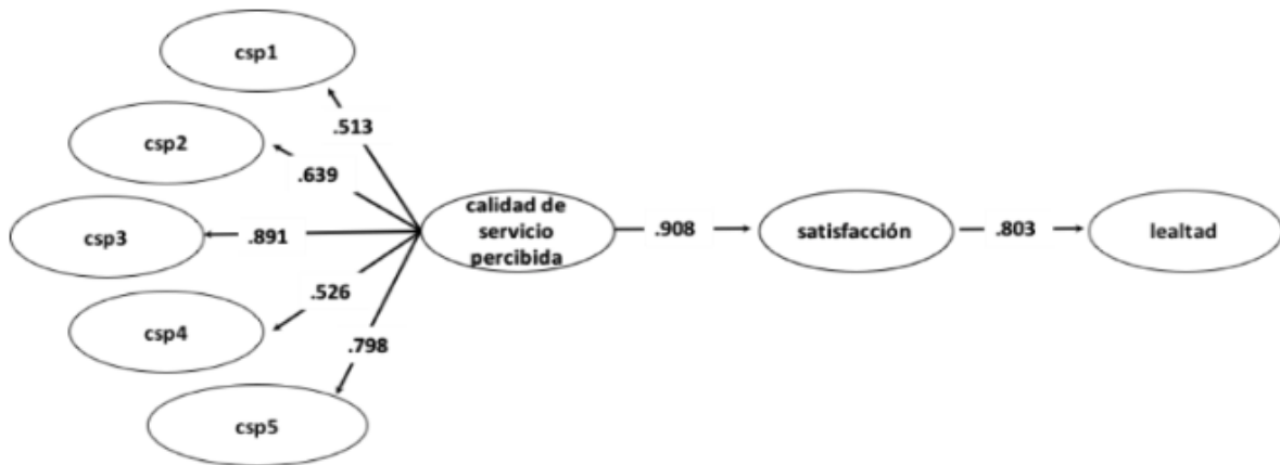
Figure 2 Summary of the structural model

NOTE: \chi^2(427) = 1273.108, p < .05, /df = 2.98, RMSEA = .058, CFI = .943, TLI = .938